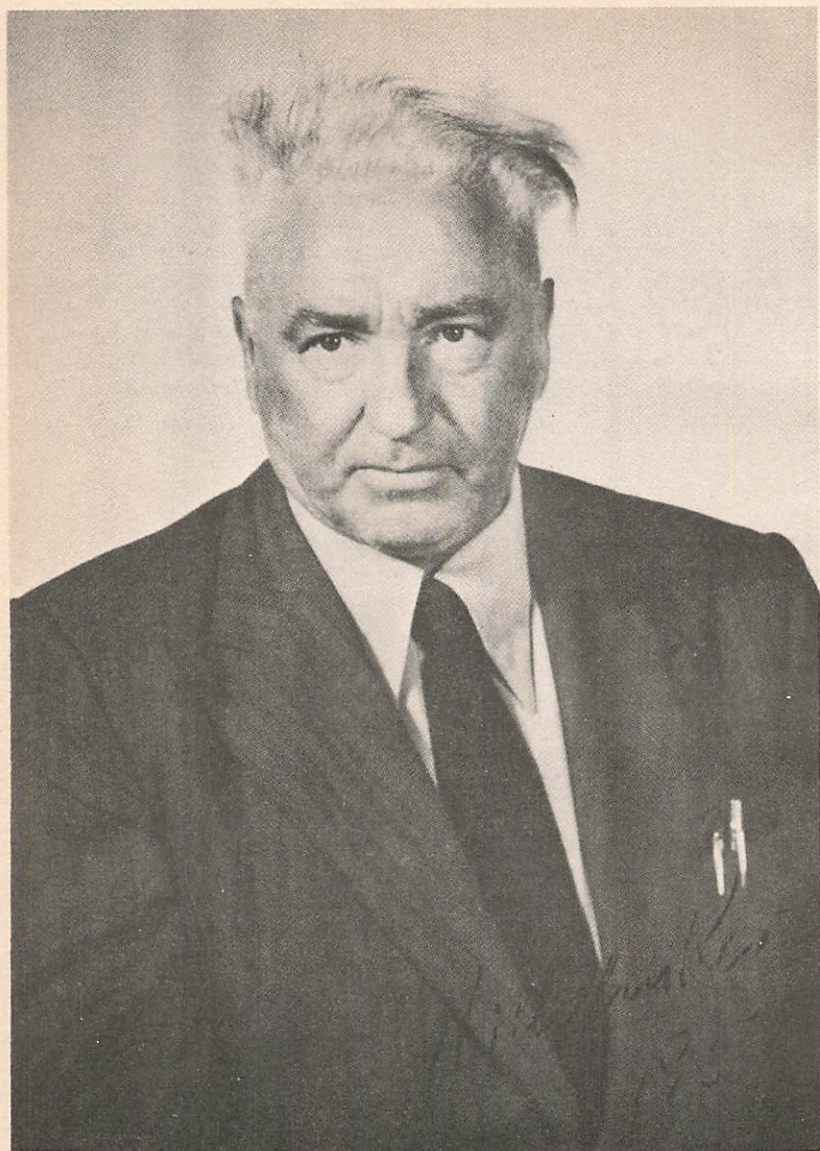
Wilhelm Reich (1952)